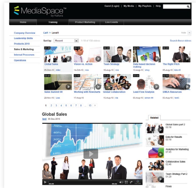
MediaSpace - Enterprise Media Portal